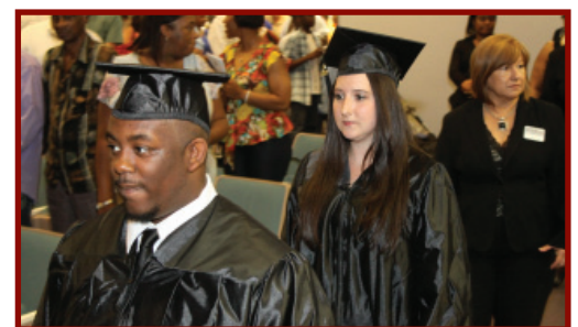
GED Graduates at Graduation Ceremony