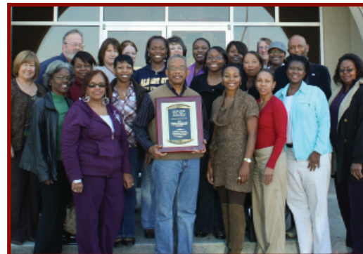
CGTC's AEP Staff Proudly Displaying Award

A winner for fiscal year 2010 will be announced in the fall. You can help by contacting CGTC's Adult Learning Center and requesting that a representative speak to your church or civic group to share the message of how the AEP is changing lives and our community.