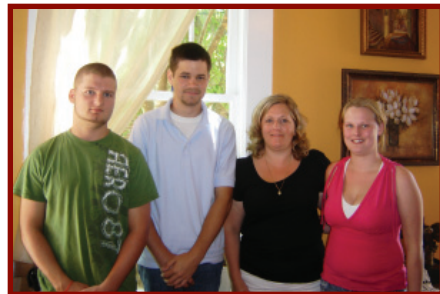
Photo from the Monroe County GED Graduation Luncheon

The program has been actively participating in the Georgia Work Ready Initiative with many students having already taken and passed the test. These students have the option to retake the test and increase their certificate level and many have accomplished this goal.