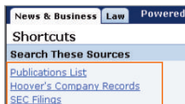
Figure 5. Shortcuts on the News and Business page

Campus Research provides a number of search shortcuts in the left frame of both the News and Business (Figure 5) and Law (Figure 6) pages.